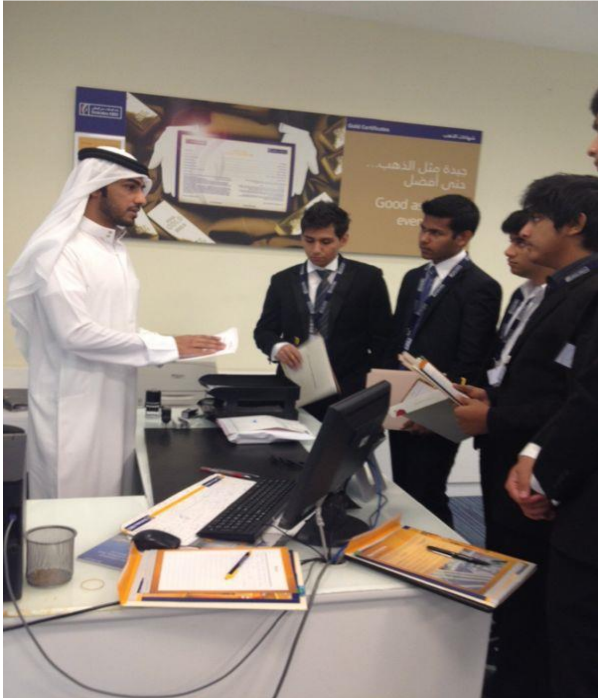
TETE & TETE WITH THE MANAGER..