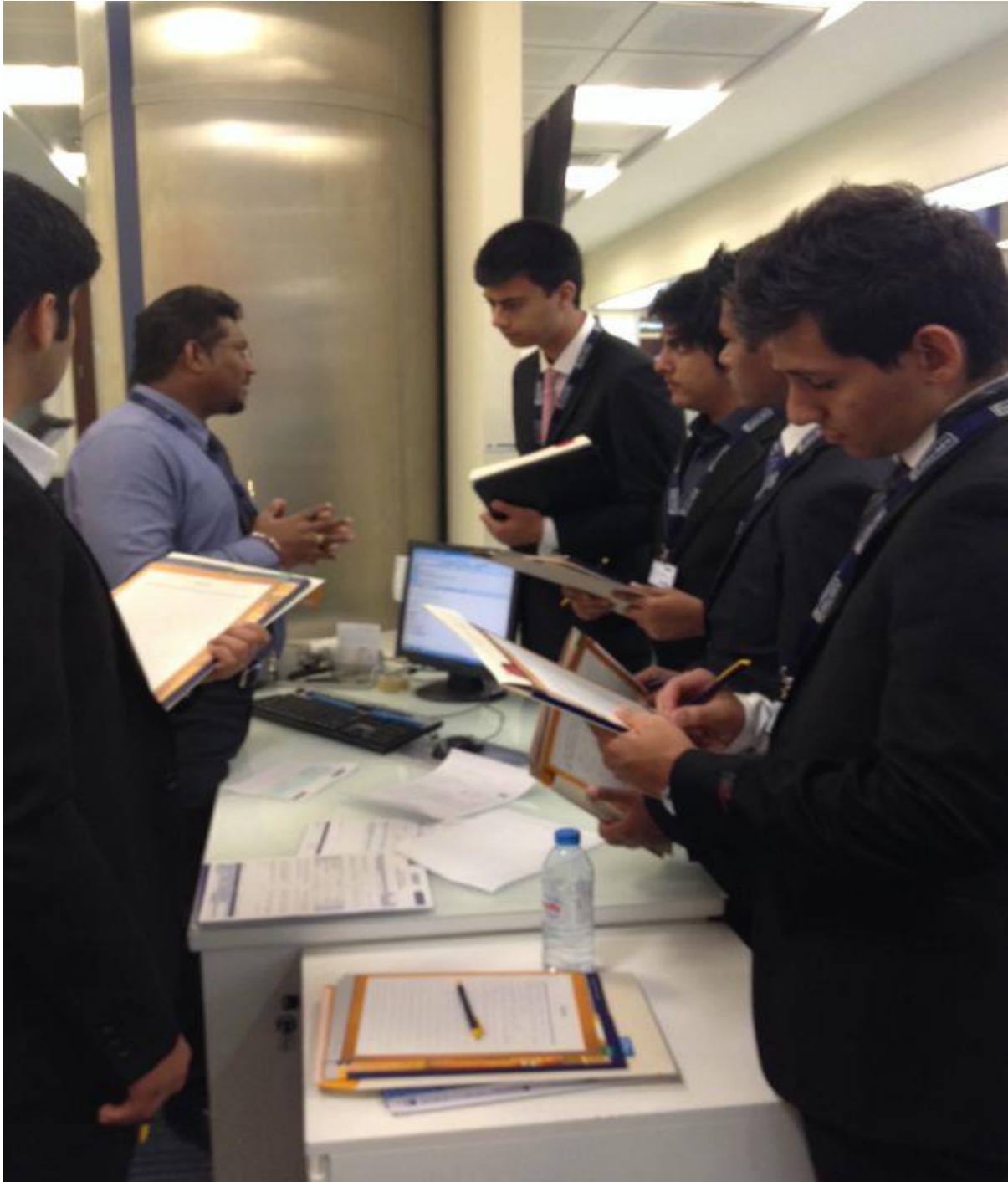
LEARNING TRICKS OF THE TRADE